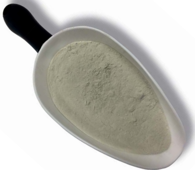
AES VIS II organophilic clay

AES VIS II is a modified organophilic clay that improves suspension and carrying capacity of invert emulsion drilling fluids.