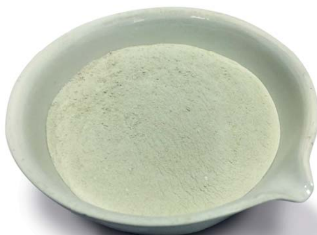
AES VIS LS organophilic clay

AES VIS LS is an organophilic clay that provides increased low shear rheology with minimal overall increase in viscosity and gel strengths