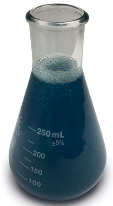
BLUE MAX Surfactant

BLUE MAX is a concentrated, cost effective, multi-purpose drilling surfactant that aids to prevent bit balling. It also performs as a cleaning surfactant for rig equipment.