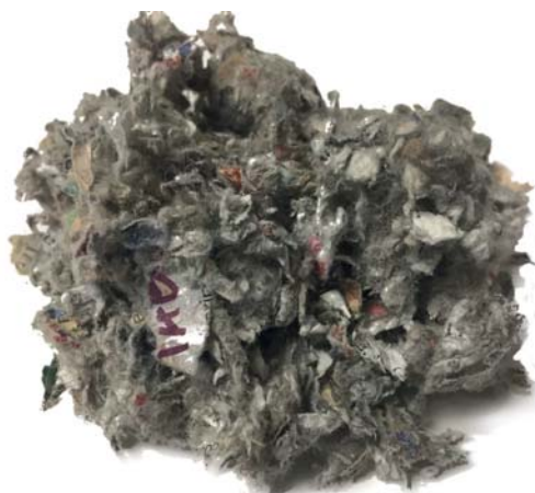
DRILLING PAPER lost circulation additive

DRILLING PAPER is a blend of cellulosic fiber materials and ground paper used as a lost circulation material in water-based drilling fluids