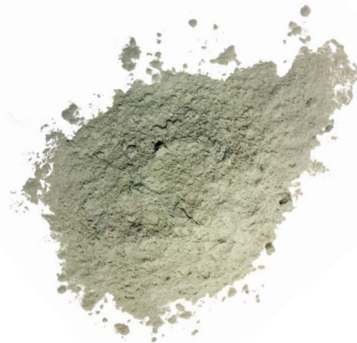
ES-VIS premium bentonite viscosifier

ES-VIS is a naturally occurring premium bentonite designed to provide an optimum viscosity profile in the EnerSEAL † fluid system.