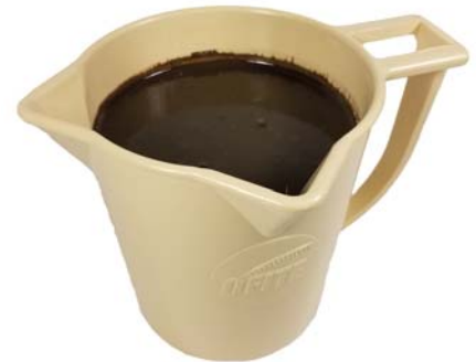
The EnerLITE system was re-used from a previous well and conditioned for the application (above).

The simplicity of the system eliminated the need for extra personnel to mix volumes and reduced the location size requirements. Minimal dilution reduced trucking requirements for water and waste.