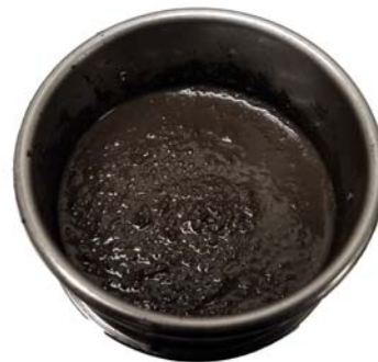
The EnerLITE system provided excellent hole cleaning and easy removal of cuttings (above).