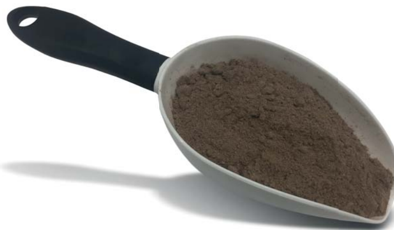
MULTIFIBER F lost circulation additive

MULTIFIBER F is a proprietary blend of fine fibrous material used to prevent or treat lost circulation and bridge permeable formations