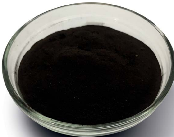
SHALETEX II shale inhibitor

SHALETEX II is a blended sulfonated asphalt drilling fluid conditioner and shale inhibitor designed to minimize fluid loss and stabilize troublesome shale formations.