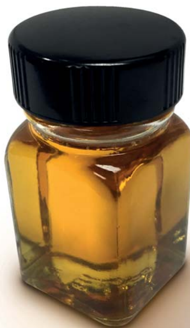
X OUT carbon dioxide scavenger

X OUT is a liquid amine carbon dioxide scavenger that effectively treats acid gas without elevating alkalinity.