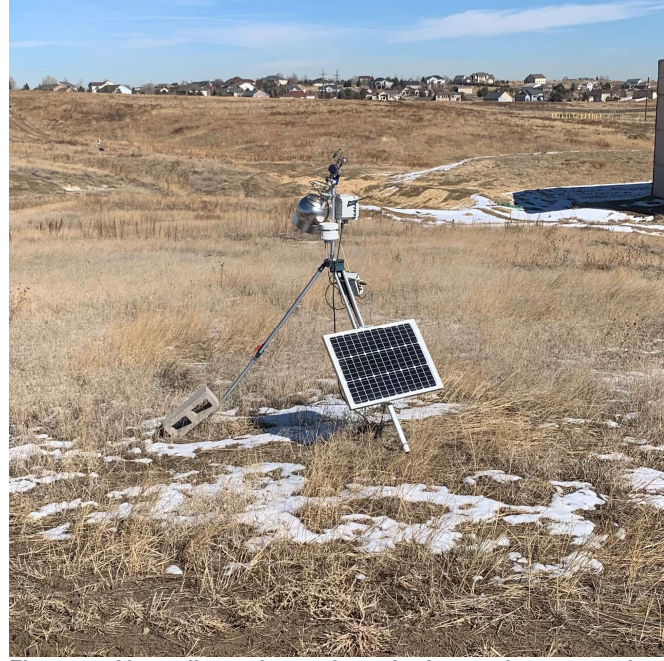
Figure 4: Air quality and sound monitoring station – note the homes in the background of the image

Sound monitoring is conducted to measure and quantify the sound level being emitted from operations. This monitoring is utilized to ensure sound levels do not exceed the decibel level required by the regulatory agency. Sound monitors are placed near the well site prior to any operations commencing to obtain a normal background noise level (Figure 4).