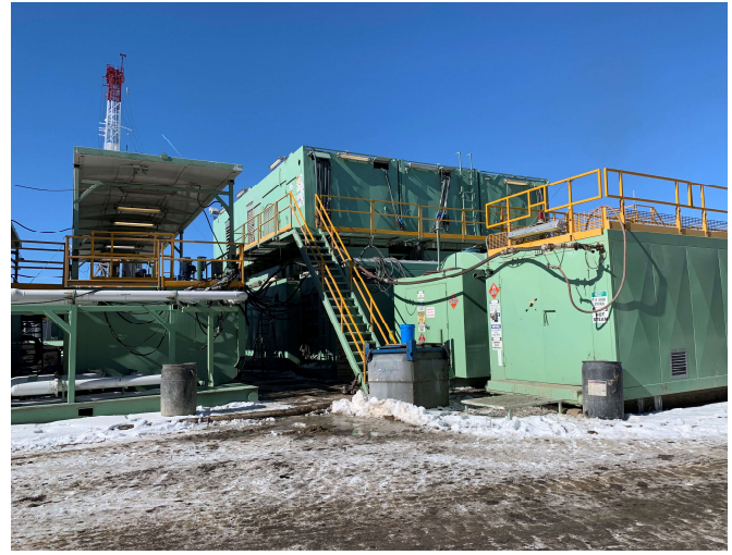
Figure 1: Stacked generators and pump houses reduce footprint

Land disruption requires optimization considering many different factors. A larger pad may eliminate a second location or allow for simultaneous drilling with two rigs, reducing the duration of the drilling campaign. Additional rig modifications can be made including stacking components to reduce the rig footprint. Such modifications have included stacking the rig generators on top of the pump house (Figure 1). Other modifications, such as special low-footprint drilling rigs, have been considered to reduce the footprint at a reasonable cost.