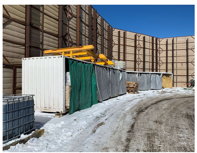
Figure 2: Drilling fluid chemical containments

Containments throughout the drilling location are placed in all areas where mud chemicals may be mixed or present aid in reducing spill risk. This includes containments for the palletized chemical which are covered on all sides (Figure 2). This both protects the sack material when not in use and reduces the likelihood of material being spilled on the ground. Additionally, containments underneath the rig pit system, hopper house where chemicals are mixed and the tank farm where various fluids are stored, all aid in minimizing spill risk onto the ground.