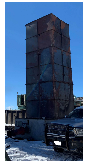
Figure 5: Self-contained flare stack

When flaring is unavoidable, efforts should be made to prevent alarm when this increasingly rare activity appears. One of the mitigations on drilling rigs are self-contained flare stacks, which provide visual mitigations that allow for the flames to go unseen. These flare stacks are comprised of a tall steel box 8'x8' wide and up to 35' high that hides the flame from sight (Figure 5).