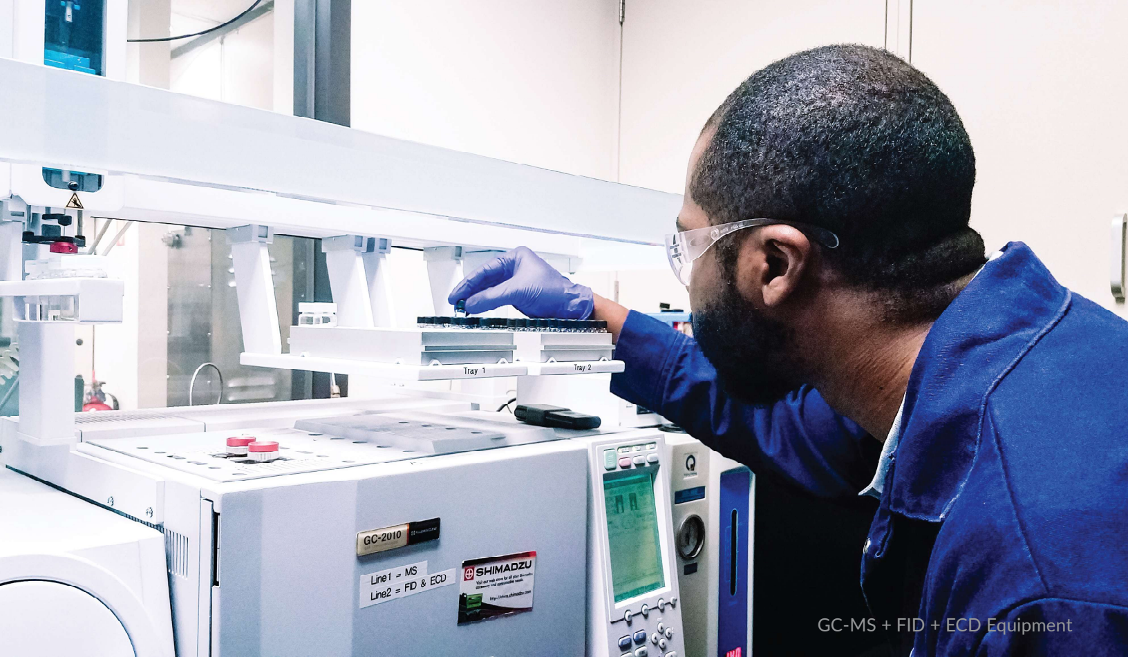
GC-MS + FID + ECD Equipment